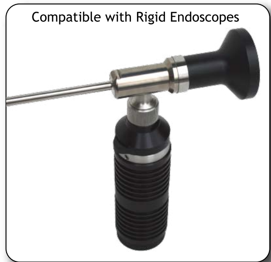
Compatible with Rigid Endoscopes