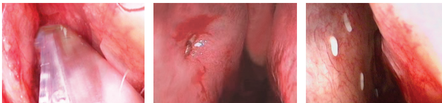
Stapling the septal flaps.

The following endoscopic images demonstrate use of the ENTact Septal Stapler.